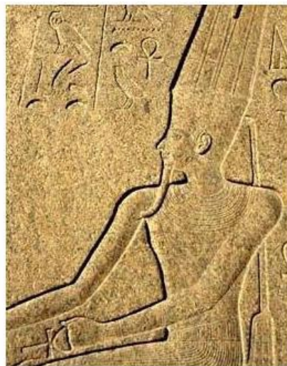
Holding the Ankh by the open end benefits the self ?