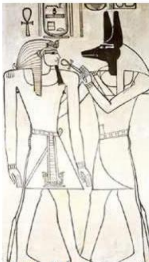
Holding the open end of the Ankh toward another benefits the other?

In The Golden Vortex I show the Egyptian Ankh made of 3 magnets forced into the shape seen in the middle illustration below. The true Ankh may have even been carved from a solid piece of magnetite, but in either case the magnet model imparts an interesting field of magnetic force; a force I first encountered in the Montana Vortex . An almost serene energy is felt from every Ankh magnet model I've made. Some Egyptian wall carvings depict this tool in the hand of a priest pointing it at another person. But more often it is simply held, perhaps conveying benefits to the holder?